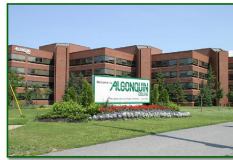
Algonquin College, Woodroffe Campus

Blackboard Meet New People Panel Kurzweil BBQ lunch CSD services ◆ Interactive workshops ◆ Intro to learning strategies ◆ Hands-on demos of adaptive software ◆ Get the tools to SLICE through your first semester!