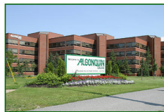
Algonquin College, Woodroffe Campus

Blackboard Meet New People Panel Kurzweil BBQ lunch CSD services ◆ Interactive workshops ◆ Intro to learning strategies ◆ Hands-on demos of adaptive software ◆ Get the tools to SLICE through your first semester!